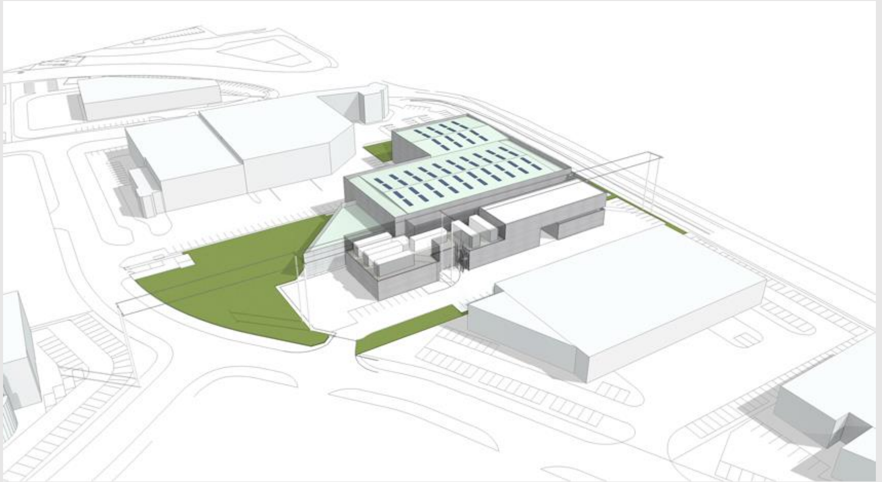
Datacentre, Ireland | 9,100 sq m