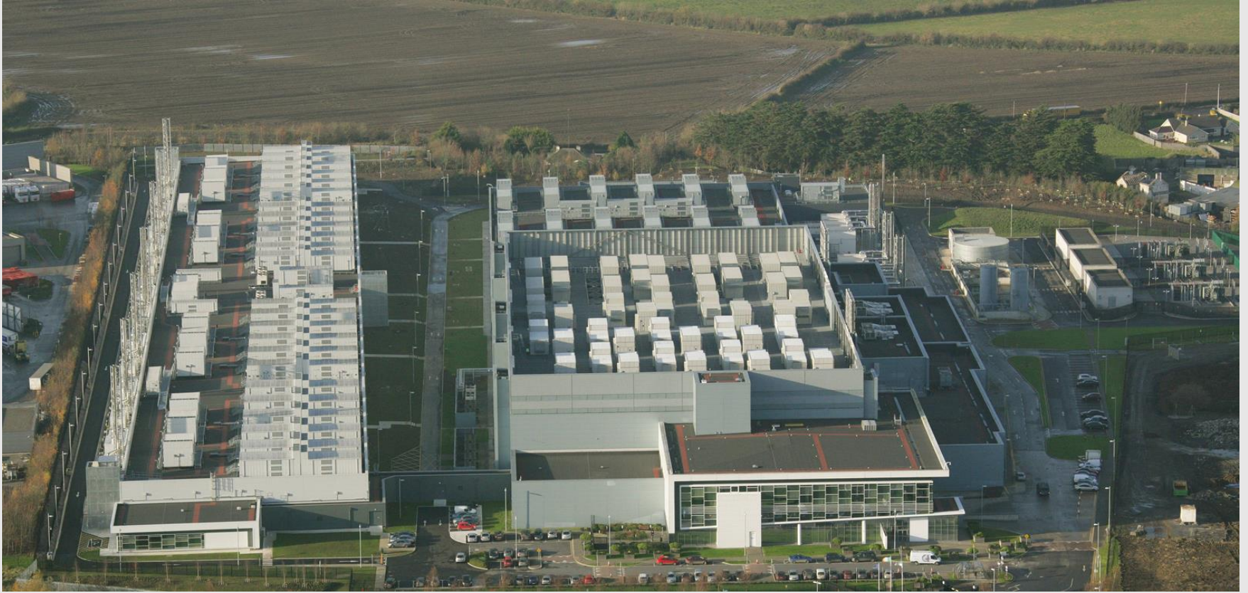
Datacentre | Ireland | 15,800 sq m