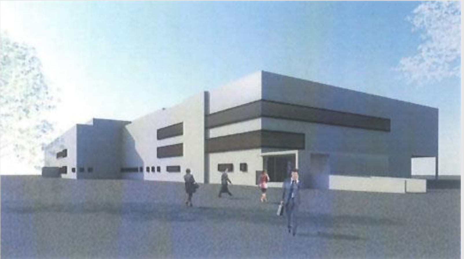
Datacentre, Switzerland | 16,250 sq m