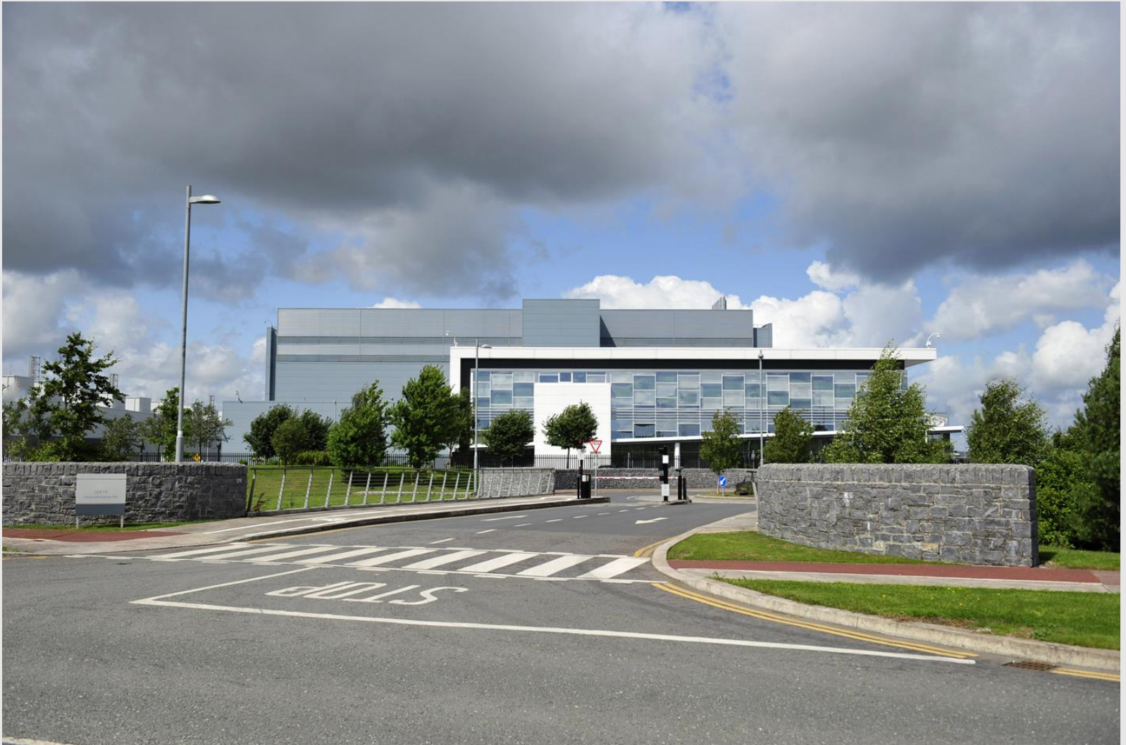
Datacentre | Ireland | 28,000 sq m