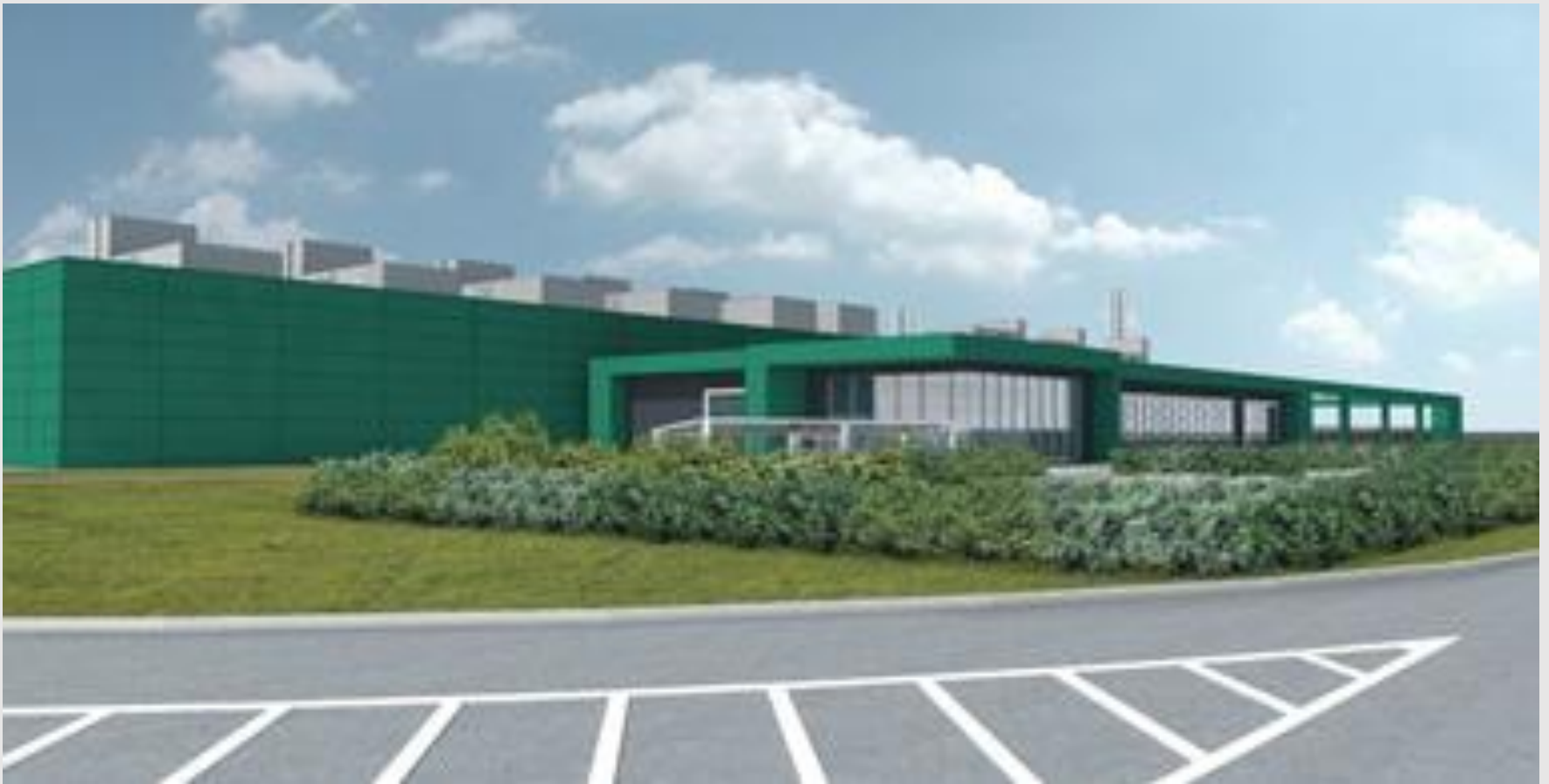
Datacentre | Netherlands | 20,000 sq m