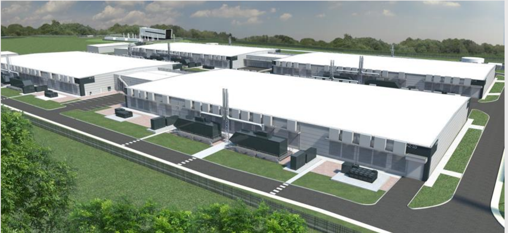
Datacentre | Ireland | 20,000 sq m